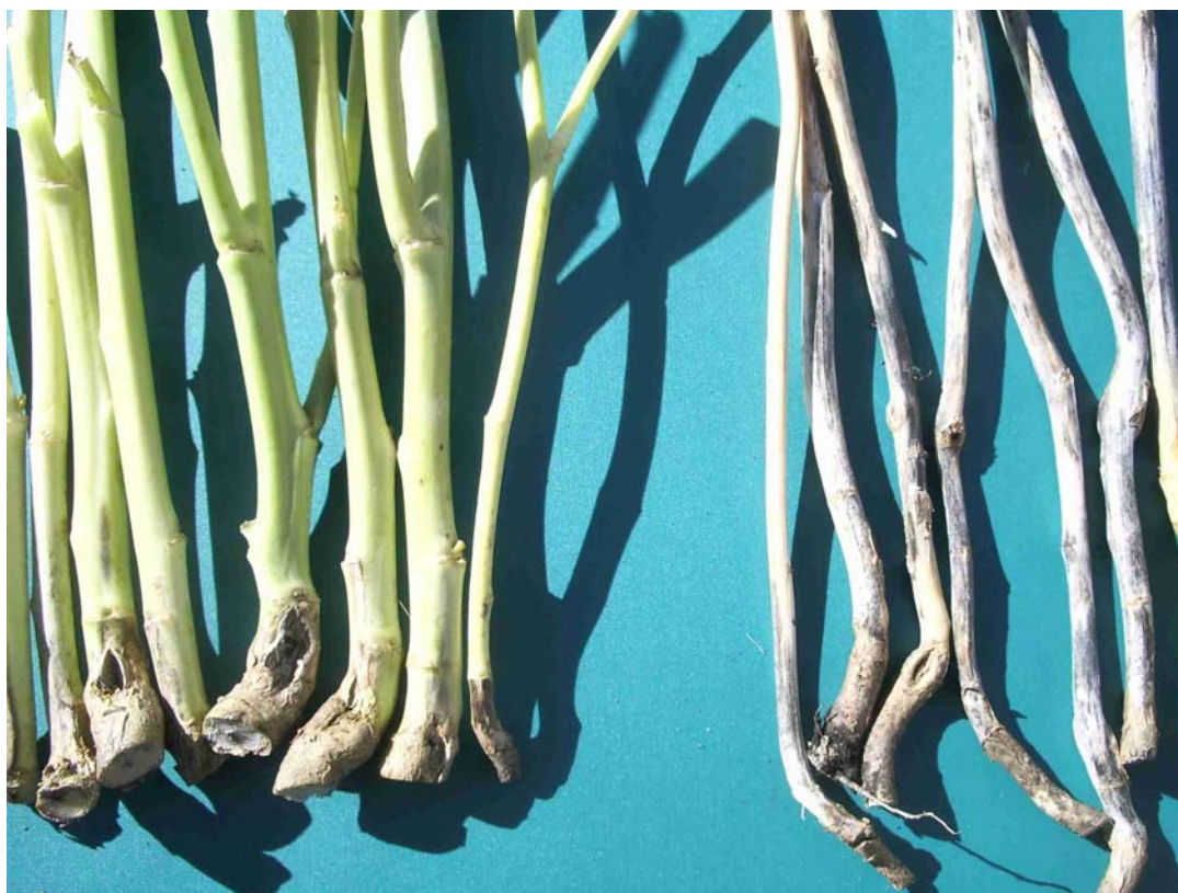
Figure 1. Symptoms of blackleg caused by Leptosphaeria maculans on the left and those of grey stem ( Mycosphaerella capsellae ) on the right. Samples taken approximately 7 days after swathing from the same field.

Blackleg can be a challenge to diagnose because symptoms result from two species: symptoms of L. biglobosa are generally superficial and not believed to have a great impact on yield 12 , while L. maculans may cause severe, yield limiting blackleg symptoms. Also, blackleg can be confused with other diseases, such as grey stem ( Mycosphaerella capsellae A.J. Inman & A. Sivanesan), which does not cause significant yield loss 14 , and is obvious on canola stems late in the season, particularly after swathing (Figure 1).