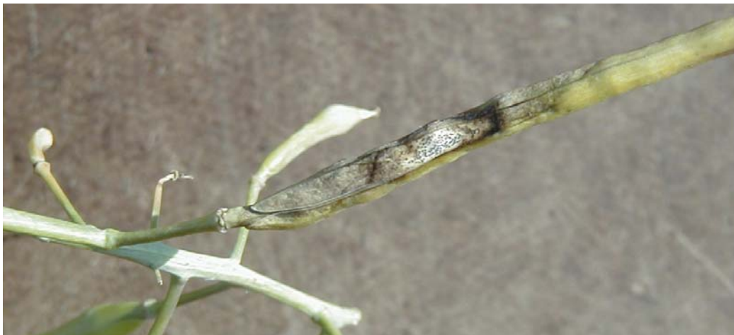
Figure 4. Blackleg symptoms on a canola pod.

Lesions on the base of the stem may be large cankers with black borders accompanied by pycnidia on severely infected plants (Figures 5 and 6), or more subtle lesions with some discoloration but little pycnidia formation (Figure 7). Researchers often clip the basal stems and observe the cross-sectional area of the stem for an indication of the severity of infection (Figures 8 and 9).