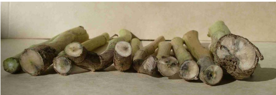
Figure 9. Clipped canola stems exhibiting varying degrees of severity of infection by Leptosphaeria maculans .

Other confounding factors, such as damage to canola stems by hail (Figure 10), or damage to lower stems caused by drift of phenoxy herbicides (Figure 11) from adjacent cereal fields, provide an opportunity for various pathogenic, and later saprophytic fungal