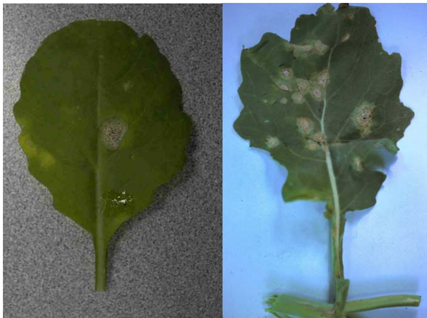
Figure 3. Lesions caused by Leptosphaeria maculans on Brassica napus varieties at the seedling stage (left) and on a lower leaf at the mid-flowering stage (right) of the crop.

specific genes for resistance to the races of L. maculans present. However, this does not necessarily indicate that an epidemic (epiphytotic) of the disease will develop. Lesions caused by L. maculans may also be observed on the lower leaves of plants at the mid to late flowering stage of canola (Figure 3).