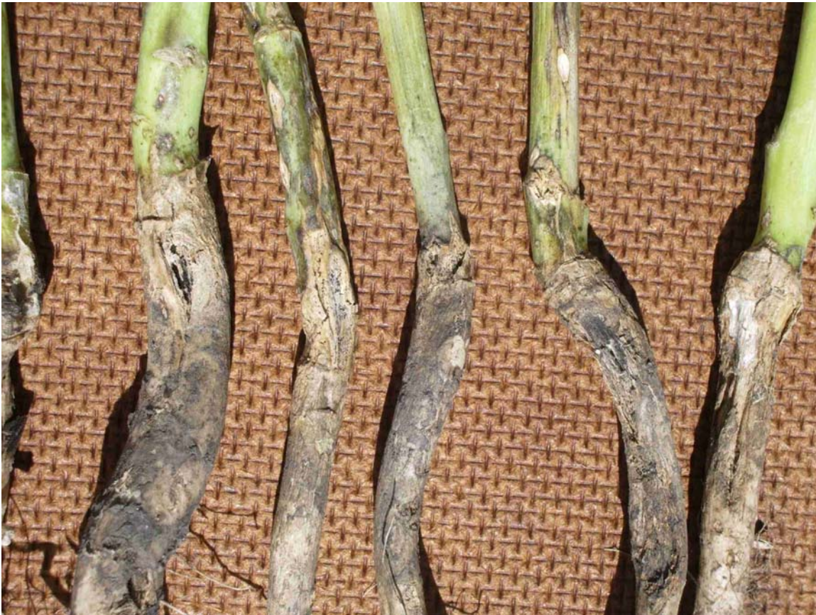
Figure 12. Blackleg symptoms in association with root maggot damaged canola plants.

Resistance. Resistance to L. maculans in Brassica spp. is of two types: quantitative or adult plant resistance and qualitative or race-specific resistance 17 . Quantitative resistance is expressed at the adult plant stage as reduced development of necrotic tissue at the stem base compared to that found in susceptible varieties, and is believed to be due to many genes, each with a relatively small effect. Qualitative resistance in Brassica spp. is usually effective at the site of initial infection on the cotyledons and leaves and is controlled by race-specific resistance genes. A resistant response is presumed to result from recognition of the corresponding L. maculans avirulence genes in a gene-for-gene manner 18 . In Canada, all commonly grown varieties of B. napus canola and high erucic acid rapeseed carry moderate to high resistance to L. maculans , although the type of resistance or the specific genes for resistance present in a variety are not generally known 19,20 .