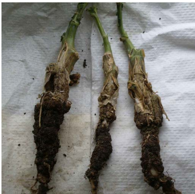
Figure 11. Phenoxy herbicide damaged canola plants that may be at increased risk of infection by Leptosphaeria maculans .