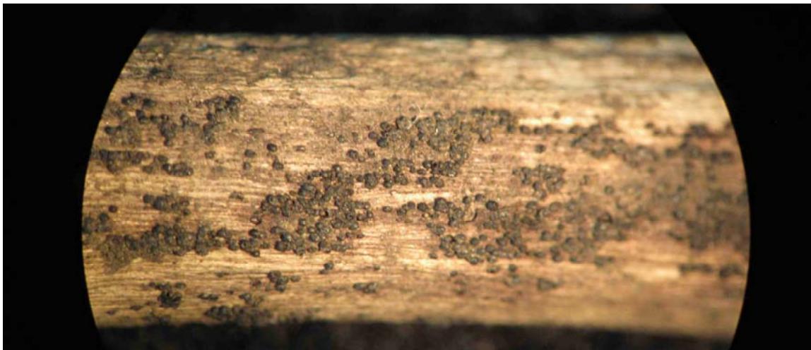
Figure 2. Pseudothecia and or pycnidia of Leptosphaeria maculans on residue of canola, cv. 'Westar'.

During the seedling stage, careful inspection can identify lesions caused by L. maculans on the cotyledons and early true leaves of canola (Figure 3). Such lesions indicate the presence of the pathogen and indicate that the variety being grown may not carry