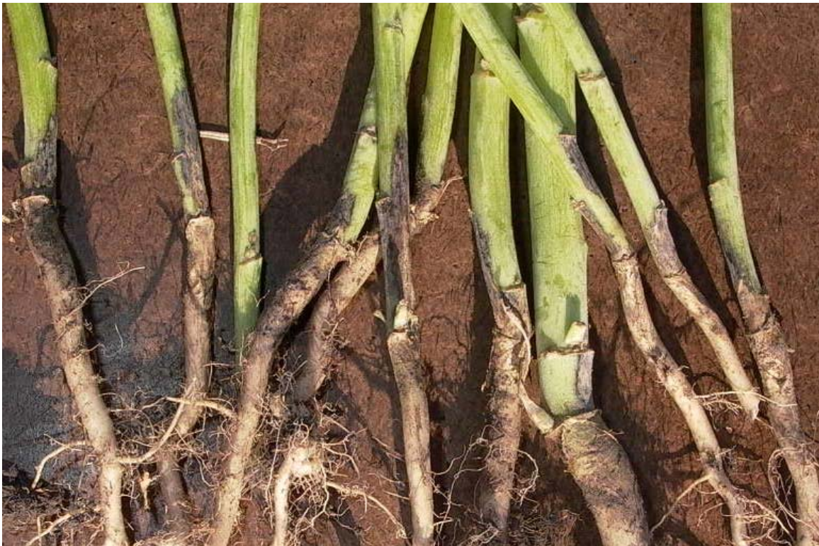
Figure 7. Less severely infected plants from an unidentified variety.