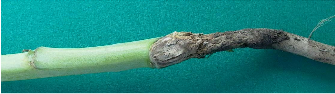
Figure 6. Canker with pycnida of Leptosphaeria maculans on unidentified variety of Brassica napus .