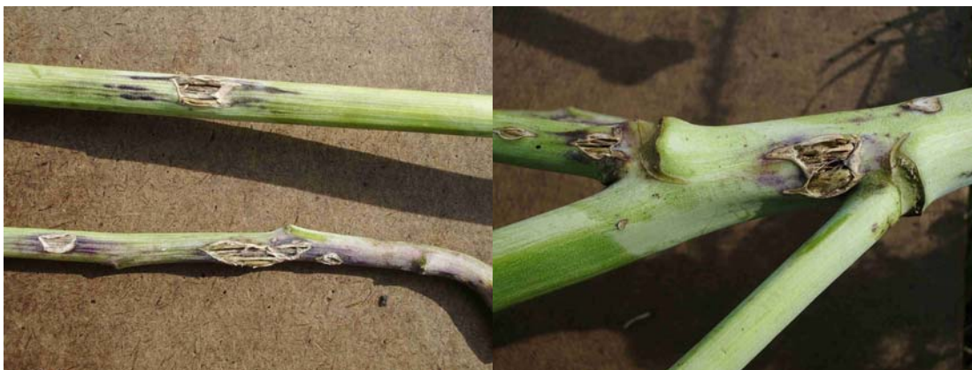
Figure 10. Hail damaged stems and upper stem from which Leptosphaeria maculans , as well as other fungal species were isolated.

year. However, this information is valuable for future years to plan and assess blackleg control strategies. Fields that are highly infected indicate that action should be taken to reduce the risk of blackleg. Highly infected fields indicate that the rotation may be too short, which results in the build up of large amounts of infected residue. It may also indicate that the resistance carried by the variety or varieties grown has broken down and different varieties should be selected in future years.