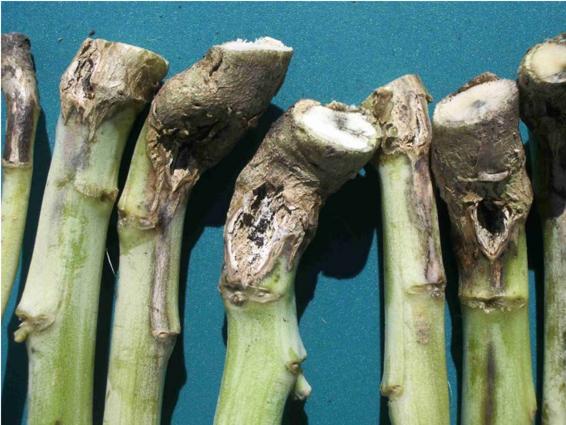
Figure 8. Blackleg symptoms on basal stems of canola plants showing blackening within the cross-sectional area of the plant stem.